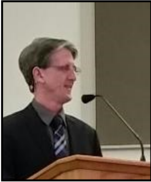
Sunday morning worship