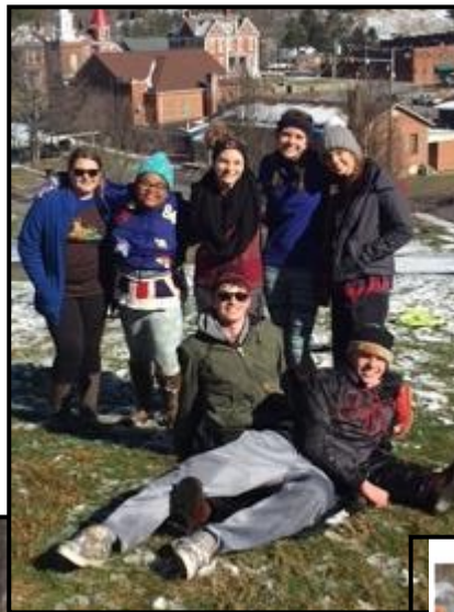
Snow Day! Sledding on the Snodgrass hill!